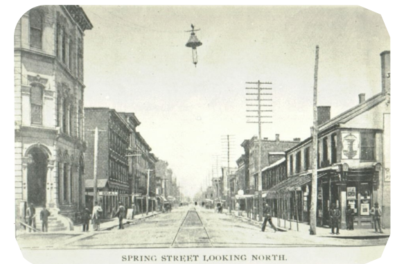
Spring Street, 1897